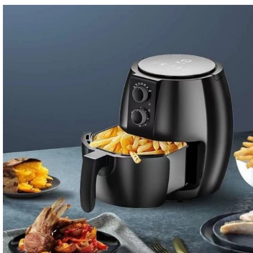
Figure 2: Air fryer with chips and chicken).

SESCOM, who distribute EPCs through Dar es Salaam, has a new EPC which will have deep frying capability – this has the potential to increase the capacity of EPCs to cook even more of the Tanzanian menu.