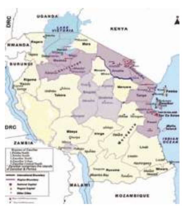
Figure 1: UAIMES-PR programme districts

The original expectation of the programme was to provide services to 55,000 rural households and 100 rural social service centres, such as schools or health centres; create 500 micro-enterprises; and train 22 village technicians and 200 operators of ESPs and SEECEs. However, subject to the approval of the EU, these targets will be reviewed to take into account the implications of the delays encountered in the implementation of this programme. The programme covers 75 villages located in eleven districts of six regions of Tanzania. The districts include Karatu, Meru and Monduli in Arusha region; Mwanga and Hai in Kilimanjaro region; Kahama in Shinyansga region; Geita and Misungwi in Mwanza region; and Handeni and Lushoto in Tanga region.